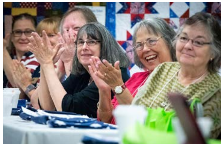
Conference attendees enjoy a presentation.

All 2018 QOVF Conference photos courtesy of Jeff Thorne.