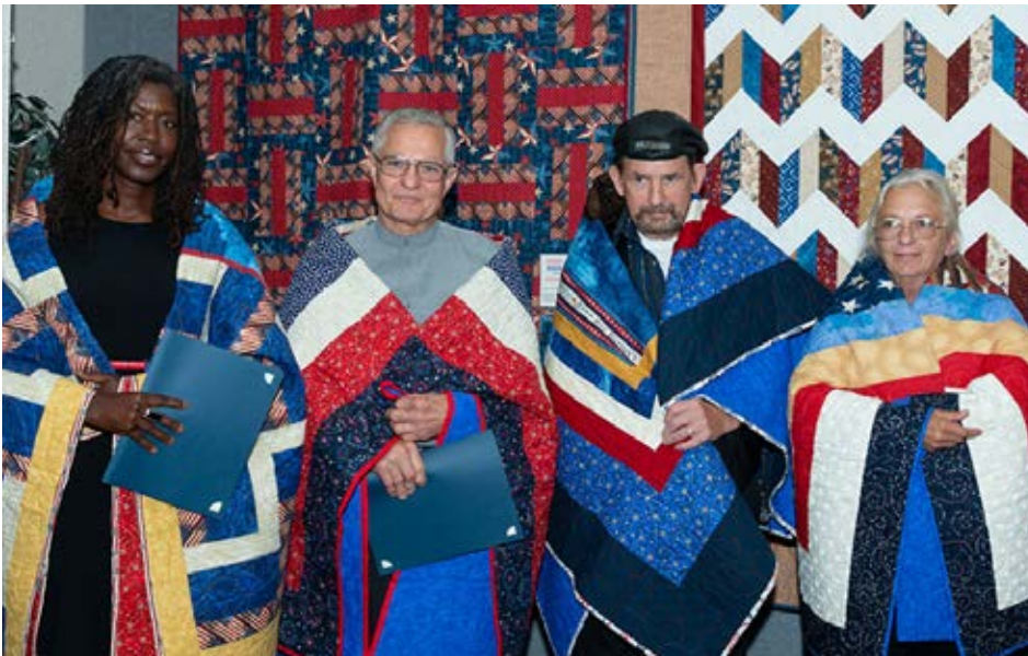
Daily QOV awards ceremonies are a highlight of the Annual Conference for many.