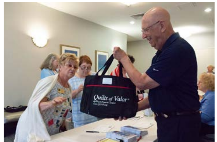
Conference registration is a busy hub as participants check in.