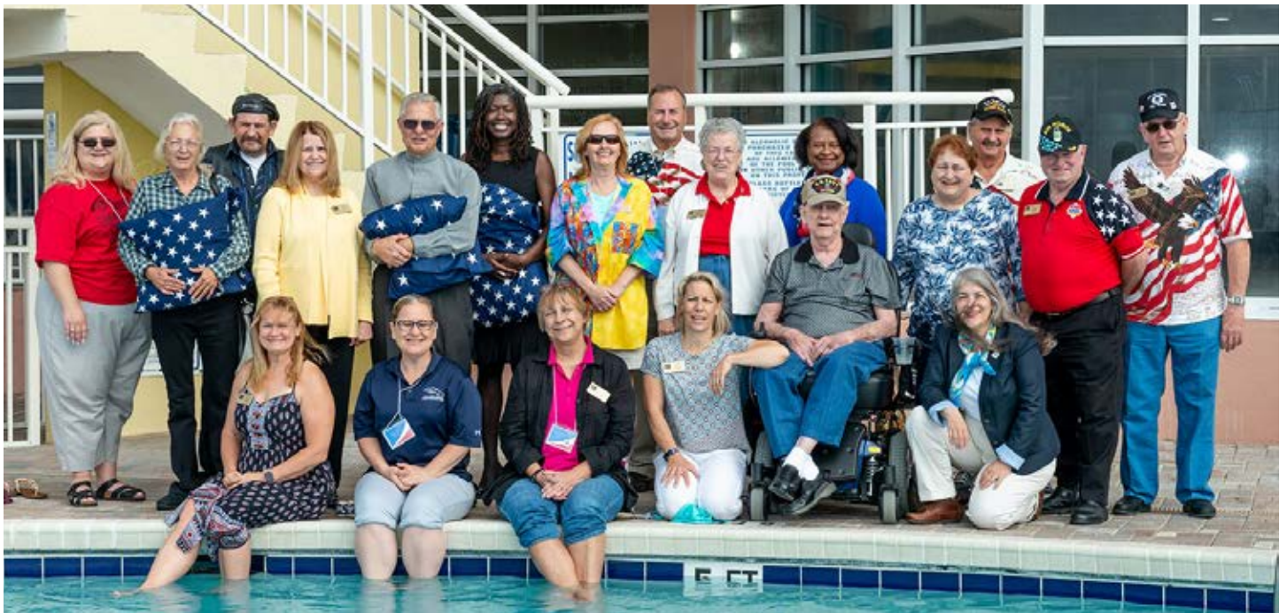
Thank you for your service! Veteran attendees at QOVF Annual Conference pose for a photo together.