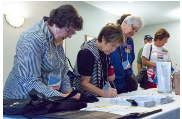
Conference attendees learn from one another and by attending special sessions that target specific topics.