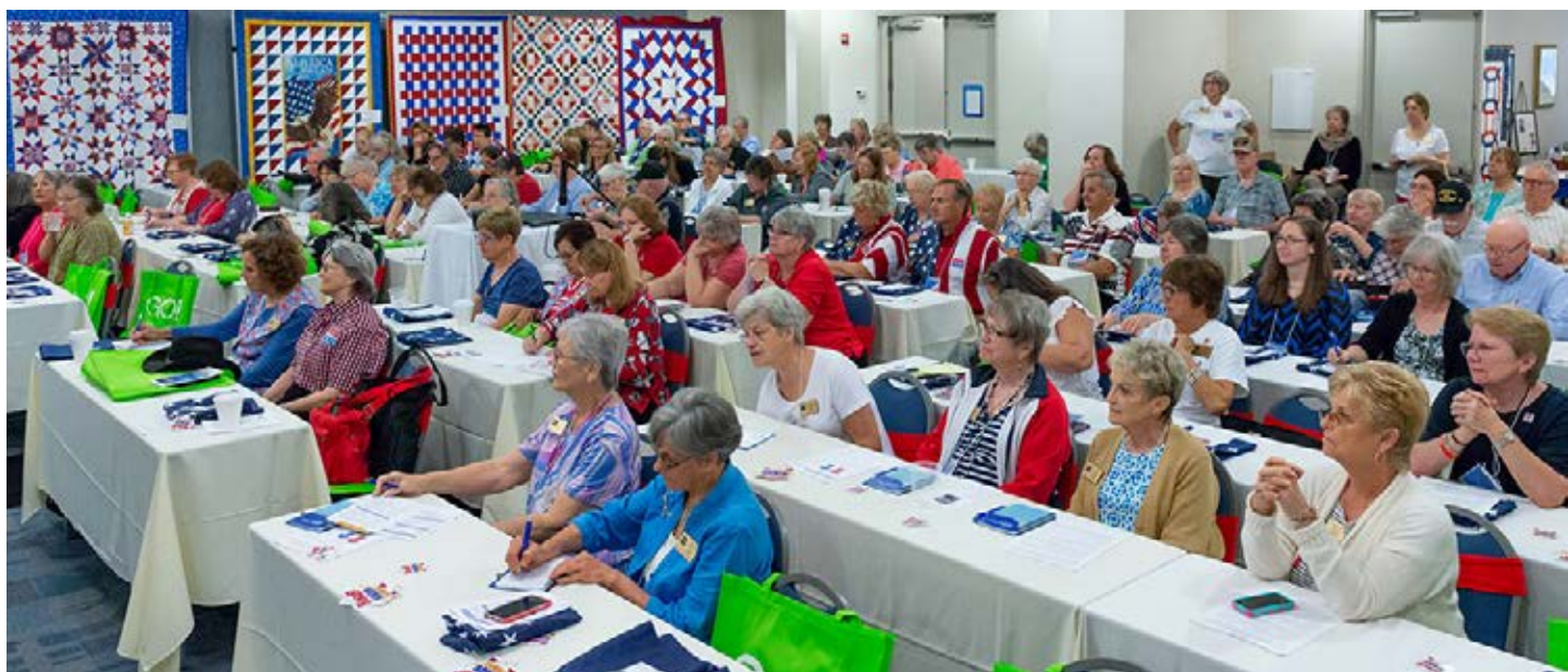
Conference attendees learned much during their meeting sessions. Much of that knowledge will, in turn, be shared with their local QOV Groups.