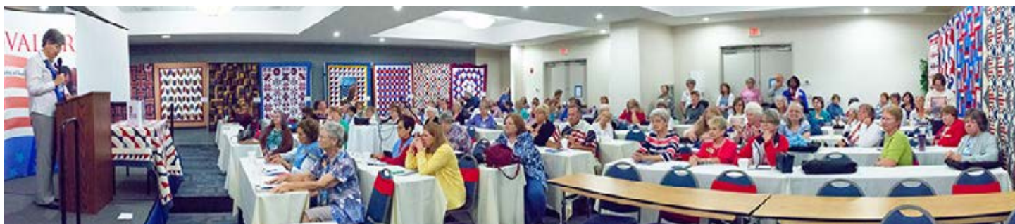
Thanks to highly engaged members, ideas and inspiration for moving the mission of QOVF forward were strong throughout the 2018 Annual Conference.

Until next time, quilt with piece and happiness, knowing you are making a difference.