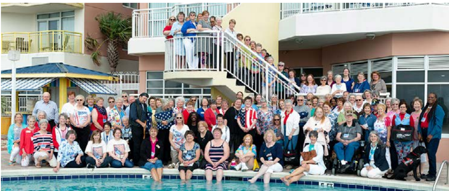
The 2018 Annual Conference wasn't all fun and games, but there was a fun photo session by the pool with attendees.