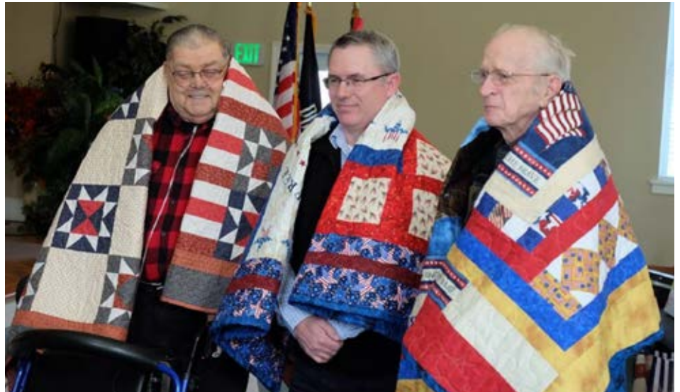
Maine's 200,000th Honorary QOVs were a family affair awarded to this father, son, and father-in-law trio.