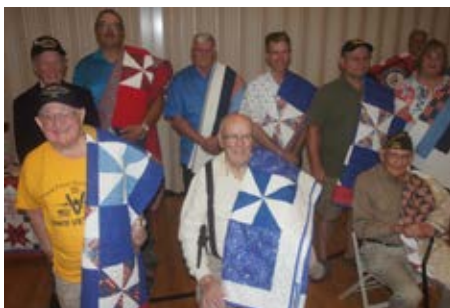
Baldwin County, AL, veterans display QOVs created for them by Scouts who learned sewing and national service skills through the Under Our Wings mentorship program. (Photos used with permission.)