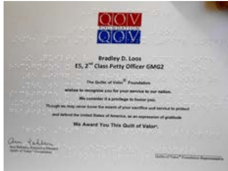
The award certificate also included braille.